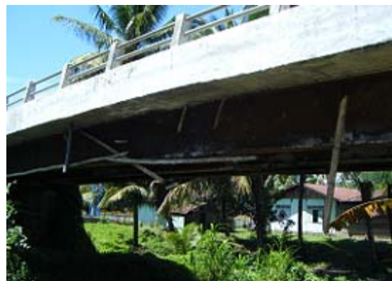
Bonobogu I Bridge: Temporary materials have not been removed completely

As outlined above, some problems have been observed in terms of staffing and budgeting in the maintenance of this project, therefore sustainability of the project is fair.