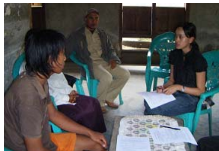
Asking local residents about changes in their living conditions in the beneficiary survey

96 % of respondents answered that the bridge upgrades had made access to markets or social services easier. Furthermore, when asked the destinations to which access had become easier, more than 80% cited improvements in access to markets. Also, 92% of respondents answered that improved access had resulted in a change in their income, with more than 90% of these answering that their income had increased. It can be surmised that the bridge upgrades have led to opportunities to earn income by making access to such markets easier.