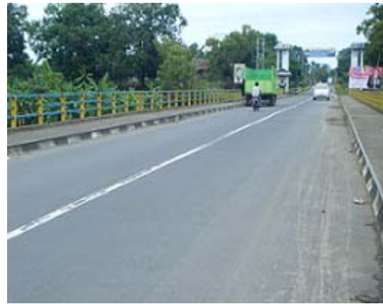
Upgraded Bridge (Poigar)