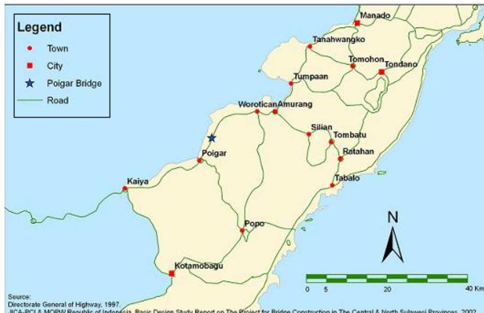
Figure 2 The Location of the Poigar Bridge

* Mobagu (Kota mobagu) is the capital city in Kabupaten Bolaang Mongondow .