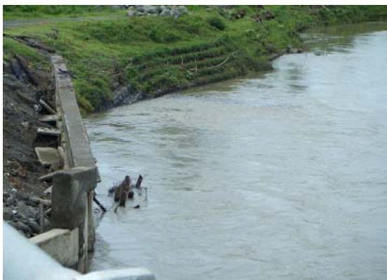
Construction to prevent erosion near the Kokobuka I Bridge (Kabupaten Buol)

Furthermore, while there is no problem with the bridge itself, in the case of the damage from riverbank erosion near the Kokobuka I Bridge caused by a change in the current of the river has been reported for several years. While the Buol office carried out construction to stop the erosion as a countermeasure, this is only a simplified response. If erosion were to continue in the future, further responses would be required. 10 In such a case, budgetary assistance from the national or provincial government would be needed. However, under Indonesia's current bridge maintenance structure, while the states of periodic maintenance and of maintenance overall are reported to the MPW under the Bridge Management System (BMS), there is no system requiring for each provincial or kabupaten office to report bridge conditions which is in charge of maintenance of provincial or kabupaten roads and their bridges to the MPW. As a result, there is no system in place making it possible to ascertain the conditions of bridges comprehensively throughout the nation as a whole, and rural bridges tend not to be selected as subjects of allocation of maintenance costs and support projects. As such, there are some concerns about future conditions.