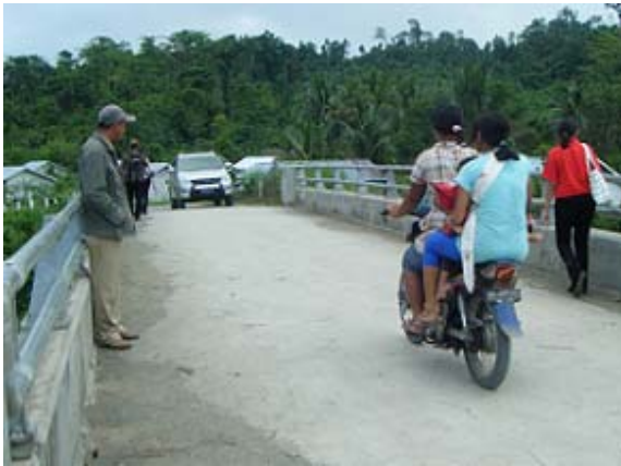
Upgraded Bridge (Kokobuka VI)

construction of a new bridge, the Megawati Bridge was excluded from this project. 4 Also, while the length of the Poigar Bridge was changed from the planned length of 120 meters to an actual length of 123 meters, since this occurred as a result of adjustment when upgrading the bridge connectors rather than extending the length of the bridge itself it had no negative effect on this project. In addition, while changes were made in riprap 5 thickness and in bridge-pier earth covering 6 , these were minor changes with no negative effect on occurrence of project effectiveness or on securing safety.