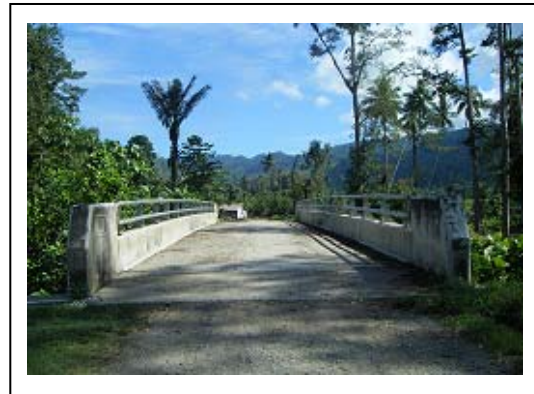
Upgraded Bridge (Pujimulyo I)