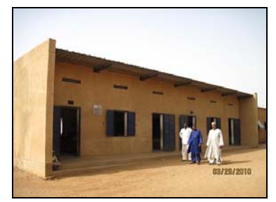
Photo 1 Typical classroom building constructed by the project (Konni Department, Tahoua Region)

However, one interviewee<sup>71</sup> commented that the design of the schools constructed by MCC (Millennium Challenge Corporation, an independent USA foreign and agency with USA government backing) was better than that of this project in terms of providing more comfortable educational environments for the students. The MCC classrooms have open spaces between classrooms where it is airy (see Photo 2). This space is relatively cool and comfortable, which is valuable in the severely hot climate of Niger. Using these spaces, students can play between classes, and teachers and COGES members can work after school<sup>72</sup>. An additional advantage is that the open space could be transformed into a closed classroom with straw walls when/if the number of students of the school increases and another classroom is required.