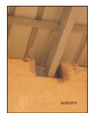
Photo 3 Narrow gap observed between the joist and the wall (Konni Department, Tahoua Region)

In 12 schools out of the 19 schools (63%), bats have nested in the space between the roof and the ceiling causing problems such as: their chirping being noisy during classes, and their excrement that produces an unpleasant odor and that has leaked out down the walls. All of these disturb students' concentration on their classes. As not all the schools visited suffered from the problems with bats problems, it is unlikely that there was a flaw in the design of the construction itself. The field research revealed that bats have most likely entered the building through the narrow gap(s) that have formed in the plaster that was used to fill the space between the joists and the outer walls (see Photo 3). Two schools<sup>73</sup> reported that the problems started directly after the completion of construction, this indicates the possibility of shoddy workmanship, such as not putting sufficient plaster around the joists.