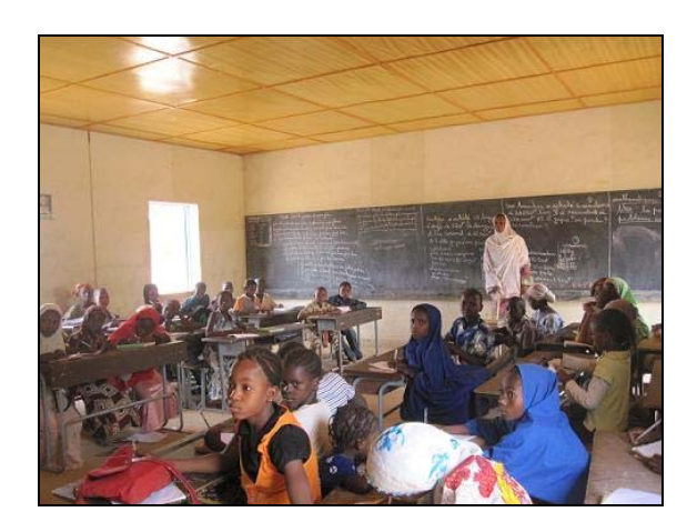
Birni Quartier School in Dosso