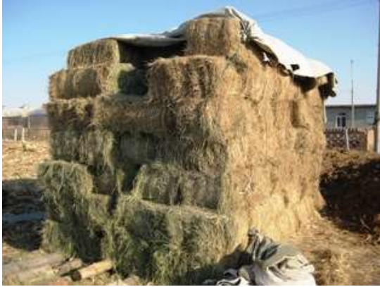
Fig.2 Forage Grass