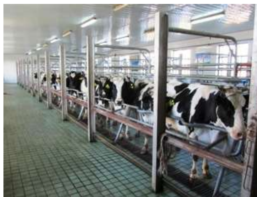
Fig.8 Milking Plant Developed at the Dairy Farming Site