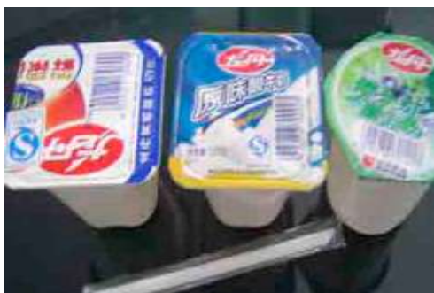
Fig.4 Longdan Milk Industry Company's Products (Yoghurt)

Prior to the project, Longdan Milk Industry Company had scarcely manufactured cheese products, but as a result of the smooth implementation of technological transfer, the move toward the commercialization of cheese products has gradually been accelerating. It was planned at first that they would request the government to start subsidizing the construction of cheese factories by around two to three years after the end of the project. However, since the market demand for cheese has not increased that much, the production scale has not expanded more than the capacity of the production line in the factory. With the relocation of the factory scheduled at the end of 2011, they are currently considering adding a production line for children-oriented cheese products, depending on the results of market research.