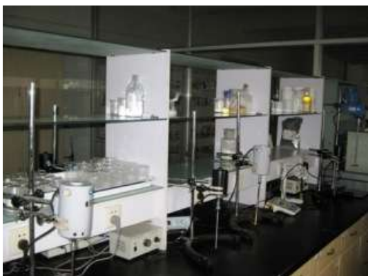
Fig.7 Inspection/Analytical Equipment at the Dairy Industry Site

they learned into practice in the project activities in one way or another.