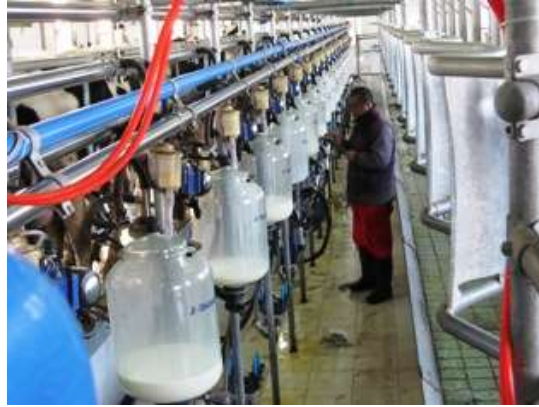
Fig.3 Milk Quality Inspection in Milking Plant at Model Stock Farm

3) Output 3: To achieve the quality improvement and diversification of dairy products.