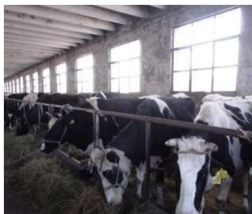
Cattle Shed at the Project Model Stock Farm