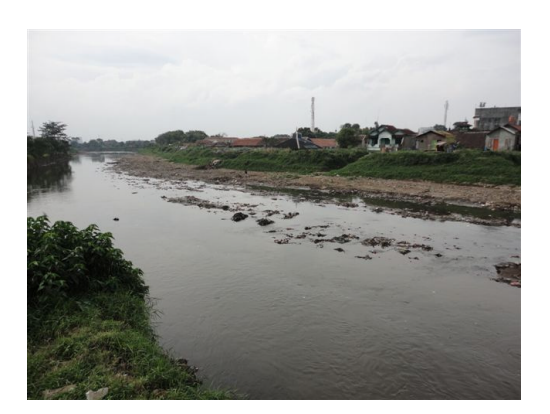
River Basin near Dayeuhkolot area