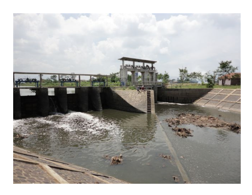
Manumotive Flood Gate