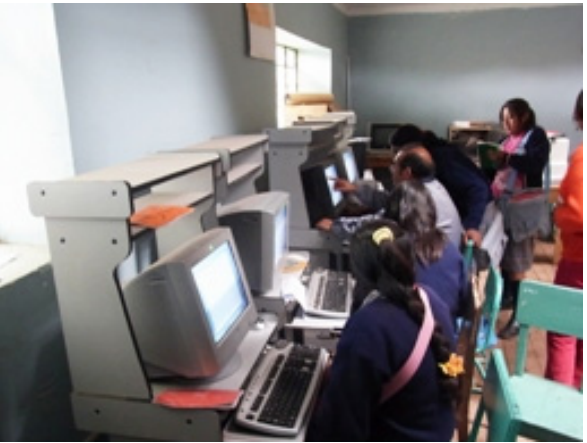
PC room at an electrified primary school