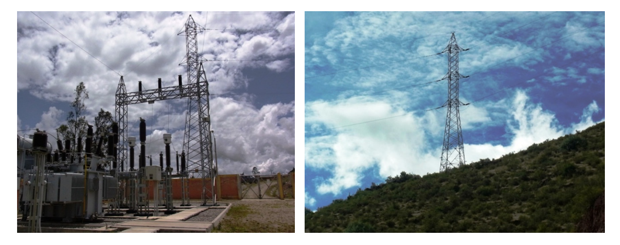
Substation and Transmission Line Constructed Under the Project (Cajamarca)