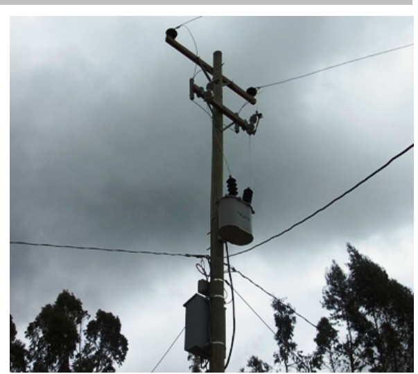
Electric Pole and Transformer in a Rural Area (Cajamarca)