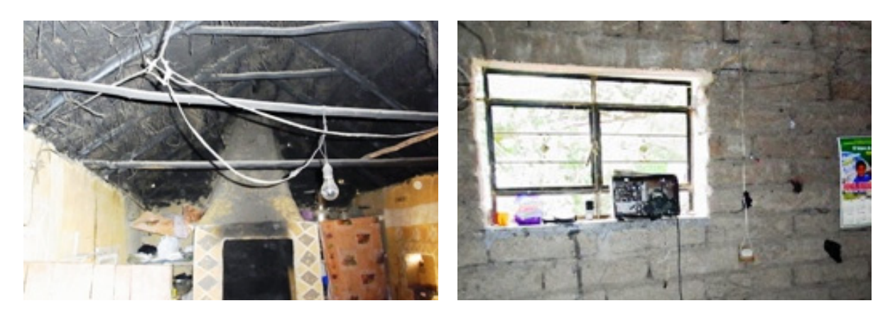
Lighting appliance, radio and power outlet at an electrified household