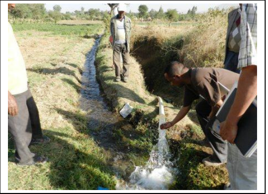
(Water is pumped up from underground)

To operate and manage the WUC/WUA, including fixing and renewing pumps, membership fees must be continuously collected. In both Badegosa and Kentri Michael, the collection of membership fees such as water fees and maintenance fees increased during the project and their financial management was improved. This was because the members understood the importance of collecting membership fees to maintain the scheme. Consequently, the collection of fees created a virtuous cycle in which the WUC/WUA could fix or purchase a pump quickly when it was broken down.