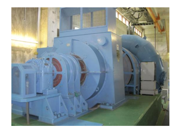
Generator Unit Provided in the Project