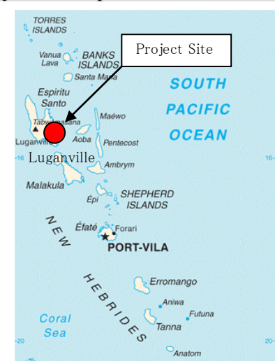
1. Project Description

In light of the above, this project is evaluated to be highly satisfactory.