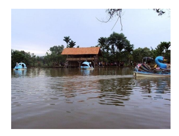
Danau Cinta: Boating Pond