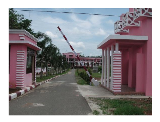
STIKES Collage Campus

Kabupaten Dharmasraya is a municipality newly established on January 7, 2004, detaching the area of the Batang Hari Irrigation System and adjacent part from Sawahlunto and Sijunjung Kabupatens. It was born as a result of the regional development of the Batang Hari Irrigation Area. In other words, according to the statements of central, provincial and kabupaten governments, if there had not been the Batang Hari Irrigation Project in the region, the Kabupaten would not exist. If that is the case, this project also exerted its influence on the municipal administration in addition to the economic and social aspects.