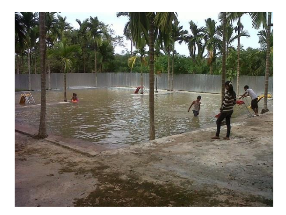
Danau Cinta: Swimming Pool for Children