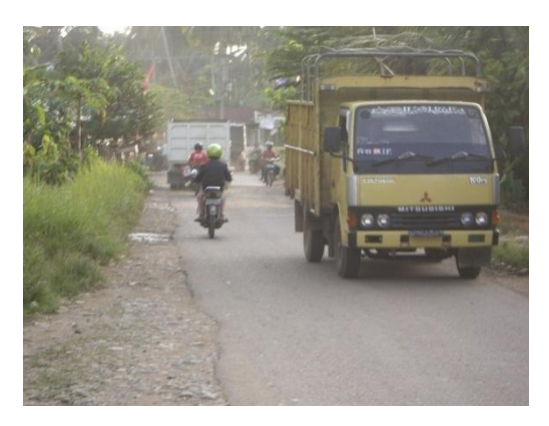
Former Inspection Road Regional Major Transport Media after Project

for their marketing transport by means of the former inspection roads constructed under the project<sup>11</sup>. Synergy with private vehicles, reflect-