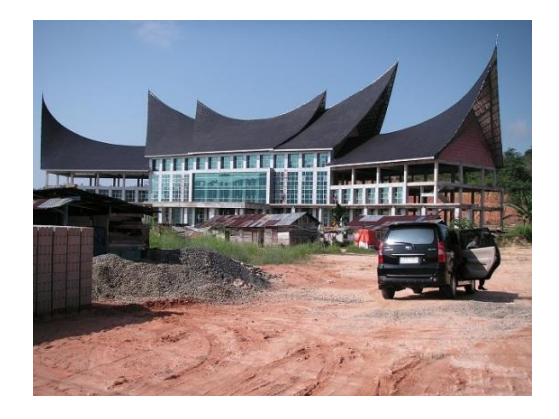
Regional Hospital under Construction