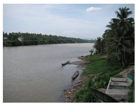
Flow of Batang Hari River Mainstream

This project was initially planned to accommodate migrants under the relocation program from the site of Wonogiri Dam in Central Java, which was constructed under Japan's ODA loan assistance in 1981. The Sitiung region which was selected for this project site is located at the right bank of the upstream Batang Hari River stretching across West Sumatra Province into adjacent Jambi