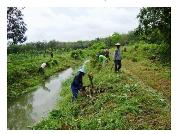
Canal Maintenance Work by Farmers

Directorate General of Water Resources, Ministry of Public Works following the Government Regulation for Irrigation, and is practically managed by the Sumatra VI River Basin Organization (Balai Wilayah Sungai Sumatera VI) continuously from the implementation phase. However, in reality, because of the system's importance stressed below, the kabupaten government discretionarily takes part in the operation, maintenance and restoration activities if need be<sup>13</sup>. As for the AESP portion, the function of the