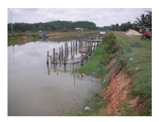
Installed Aquaculture Cage on Primary Canal

Individual-based fish farming is widely operated in the project area installing small-size fish cages (kerambah apung) on the project primary canals and contributing to additional cash income for farm households. However, the Kabupaten Office of Public Works, which is responsible for canal management, and the Office of Environment are carefully watching and regulating those activities because disordered expansion of this practice will damage the water flow and quality.