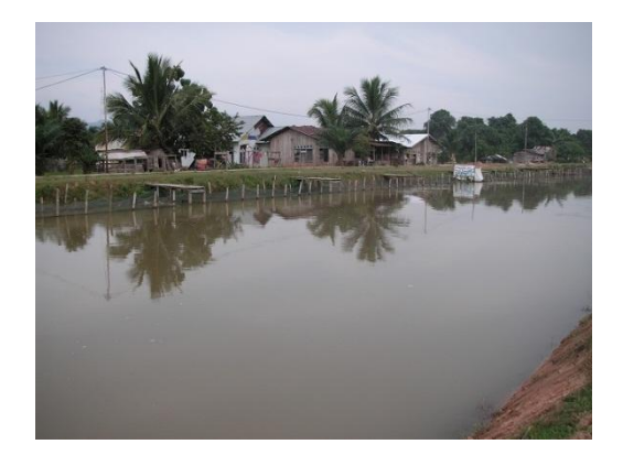
Primary Canal Functioning as a Regional River