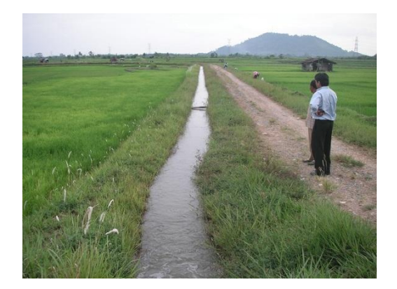
Tertiary Canal Extending to Farm Fields

(1) Impact Study conducted within Project