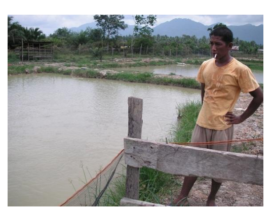
Aquaculture by Group Farmers

tion). A concrete production plan has not been fixed yet; however, it is expected to produce several million fry after the completion.