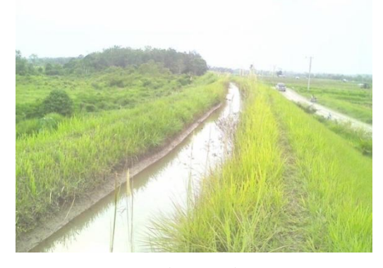
Secondary Canal Arid Soil Turned Watery

respondents mentioned that it was not until the project completion when the dry season ceased