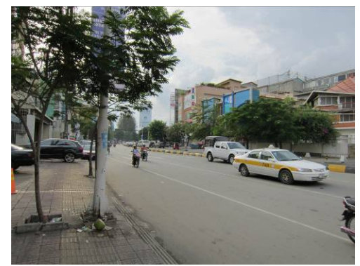
Road attached to Toul Tompong Intersection