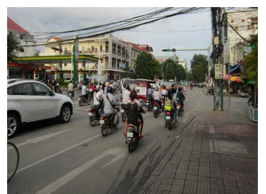
Toul Tompong Intersection after improvement