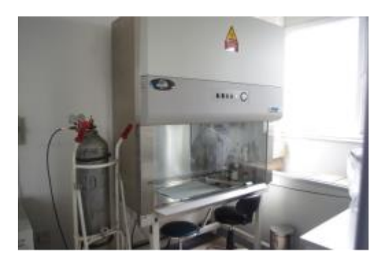
Figure 3: Laminar flow clean bench at the Liaoning Provincial CDC