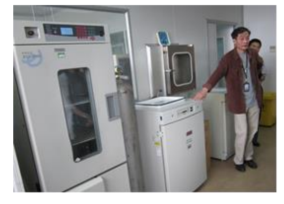
Figure 10: Anhui provincial CDC

The number of facilities that were actually covered by the project in each province is shown in the table below. Except for some facilities that were excluded in the provinces of Liaoning and Hunan, the project was carried out according to plan. As mentioned in the "Relevance" section, the acquired equipment was decided based on a procurement list prepared beforehand thus there are almost no changes in the actual output.