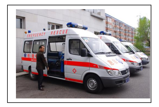
Negative pressure emergency ambulances acquired by the Project (Heilongjiang province)