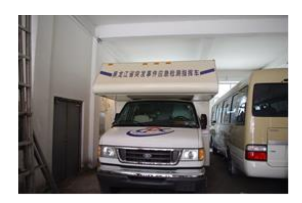
Figure 4: Mobile emergency-testing laboratory in the Heilongjiang Provincial CDC

While the strengthening process of the public health system was calling for urgent attention, a timely input of equipment was crucial to fulfill the objectives of this project and consequently required a speedy procurement process. This procurement method can be evaluated as appropriate in order to be able to respond to such needs. The following points provide a reference for the implementation of similar projects that cover a large number of facilities in equally broad areas when an efficient project execution is being pursued.