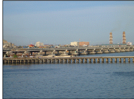
Coastal Road Viaduct Section