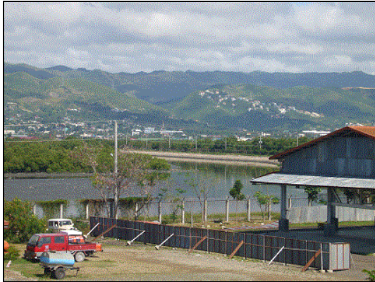
Reclaimed land (Sea Channel)