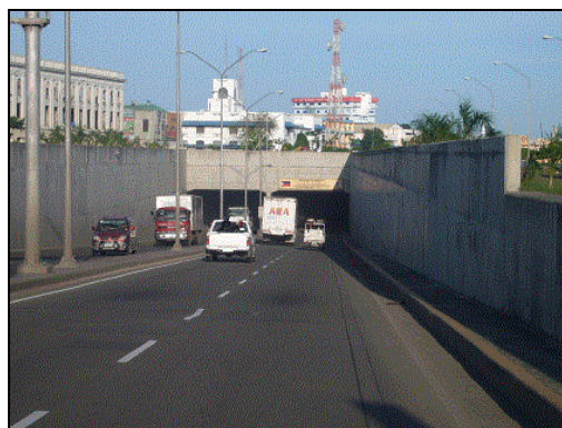
Coastal Road (Tunnel section)