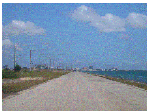
Coastal Road (Causeway section)

DPWH has developed and possesses various manuals including those for road repair/maintenance, road maintenance activity, and road safety. For a newly employed staff, training is undertaken using DPWH's manuals and he is assigned to the field work. The routine maintenance work has been undertaken by force account, and technicians and workers have sufficient technical skills. The periodic maintenance work (such as replacement of expansion joints) and major rehabilitation (such as overlay), which require special equipment and skills are undertaken by contractors, who were selected through the competitive bidding process. The District Engineering Office, in charge of the project sections and district, has regularly undertaken training and prepared required manuals, and thus, there are no technical issue to sustain the effects of the project.