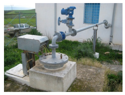
Pumping Facility (Gmara Village, Beja Governorate)