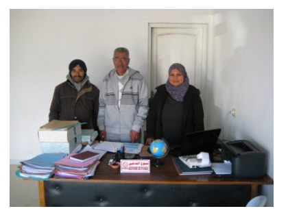
Board member and staff of GDA (Bir Ben Zahra Village, Nabeul Governorate)