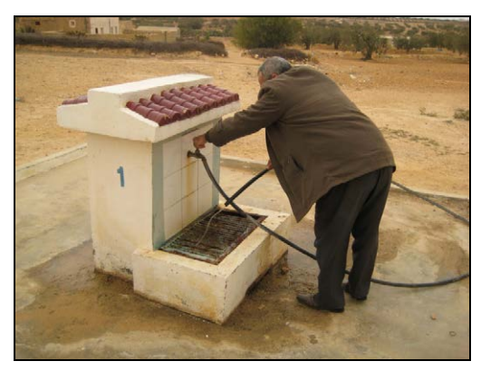
Public Water Tap in Mahdia Governorate