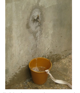
Individual water pipe connection (Soumara Bon Slim Village, Mahdia Governorate)