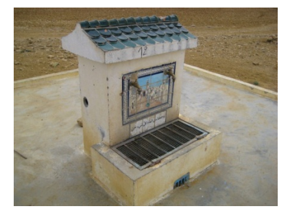
Public water tap (Ghanzour Village, Kairouan Governorate)