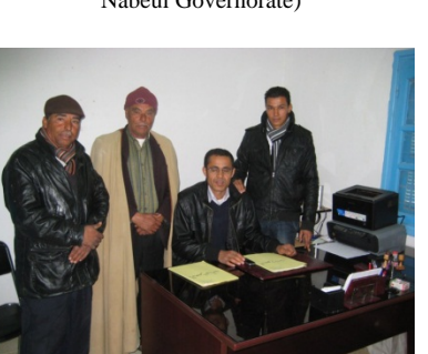
Board member and staff of GDA (Soumara Bon Slim Village, Mahdia Governorate)