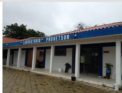
(PROVETSUR Laboratory at Gabriel Rene Moreno University (Bolivia))

The university named the laboratory “PROVETSUR” after the project commonly used name.