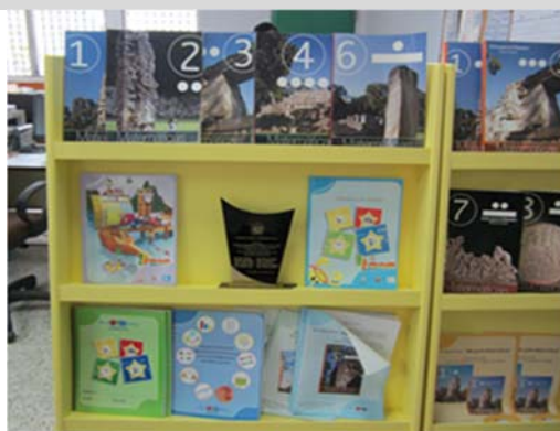
(Materials developed by the Project)