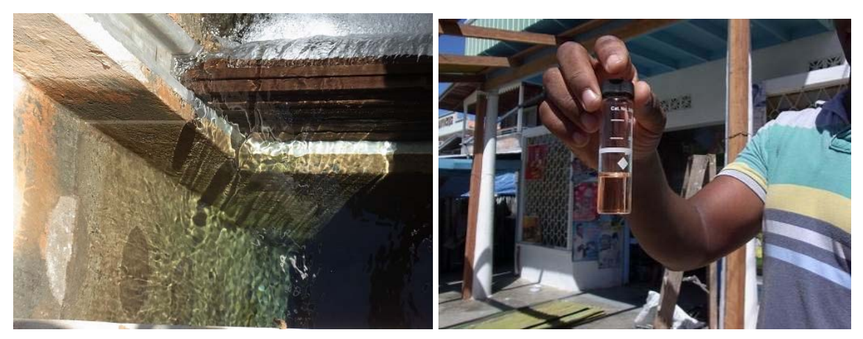
Purified water (No. 56 Village WTP)

To sum up, the achievement level of the objective concerning the supply of safe water is judged to be fair.