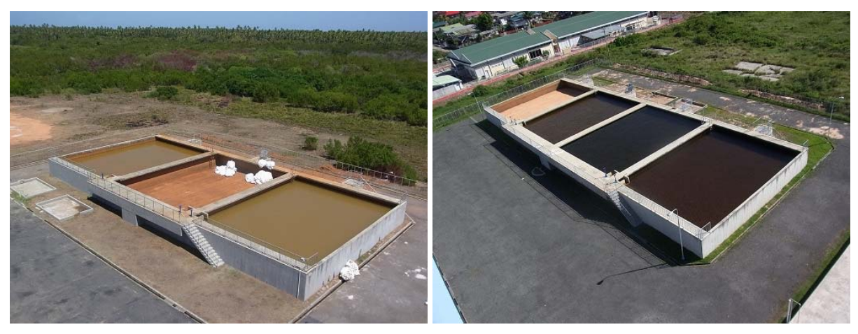
Slow sand filter bed at the No. 56 Village WPT (left) and Queenstown WTP (right)<sup>17</sup>

At the time of the ex-post evaluation, the GWI is examining ways of reducing the quantity of pre-filtration chlorine injection or even eliminating this injection altogether by shading the facility by a structure, etc. to suppress the propagation of algae.