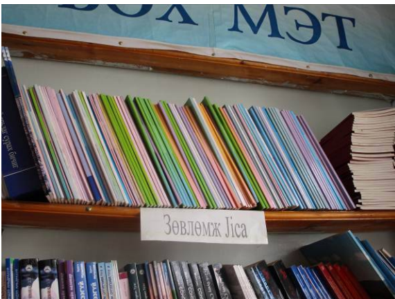
Teacher's Guidebooks available at the library of a model school in Dornod Aimag

It was found that the Teacher's Guidebooks developed by the project had been still used by a number of teachers. It has contributed to the continuous use of Guidebooks that not only the JICA experts but also the lecturers of the Teaching Methods Improvement Centers and active teachers, etc. were engaged in developing the Guidebooks, which helped the Guidebooks to be user-friendly for teachers in the field. It will ensure a medium- to long-term use to involve various stakeholders, users in particular, and reflect their views in developing manuals and guidelines such as Teacher's Guidebooks, which intend to be widely and long used by target users.