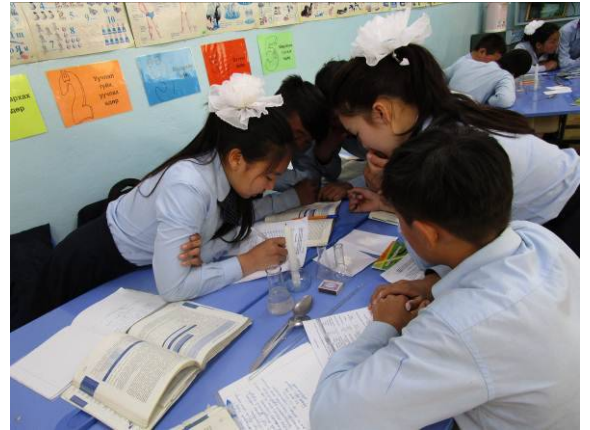
Scenery of class at a model school in Selenge Aimag

<Other Impacts at the time of Ex-post Evaluation>