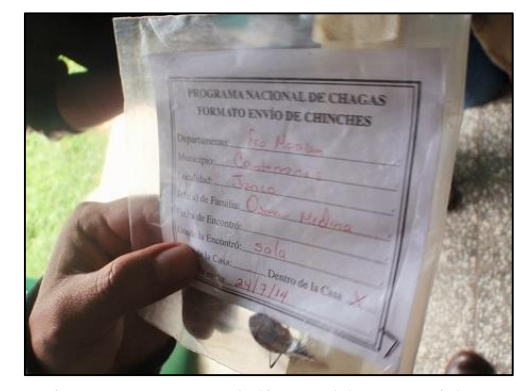
Figure 2 Vector delivered by a resident