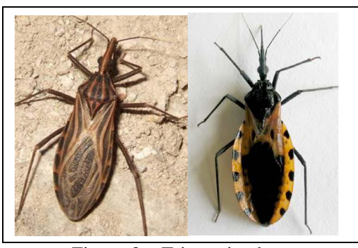
Figure 3 Triatomine bug (Left: R.p. , Right: T.d. Approximately 3 cm.)

Chagas disease (also known as American trypanosomiasis), designated by the World Health Organization (WHO) as one of the neglected tropical diseases, is a widespread illness in Central and South America caused by the protozoan parasite Trypanosoma cruzi ( T. cruzi ) which is transmitted by the triatomine bug (also called "kissing bug")<sup>34</sup>. The number of infected persons in Central America as of 2000 was estimated at 2.44 million, and in Honduras alone the number was approximately 300,000 (Schofield 2000). Chagas disease has 2 phases. The initial (acute) phase lasts for about 2 months after the infection. During