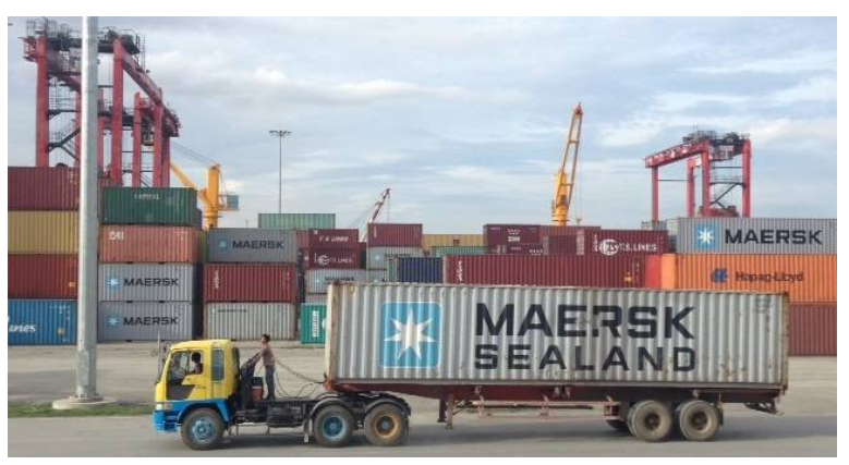
Port Activities of PPAP