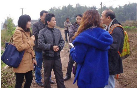
Photo 10: Consultations with Stakeholders of Changning County’s Forestry Bureau

The interviewees responded that the current personnel assignment did not cause particular labor shortages or hinder the performance of their duties. Nor were there any replies to questionnaires from any of the 12 counties that indicated personnel-related problems. Judging from these facts, the basic personnel assignment system can be evaluated as being maintained appropriately.