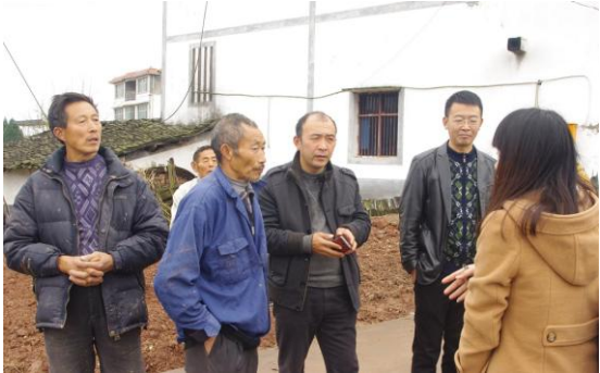
Photo 11: Consultations between Officials of Xichong County’s Agricultural Energy Bureau and Farmers