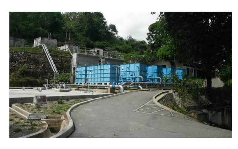
Bemos Water Treament Plant Facilities