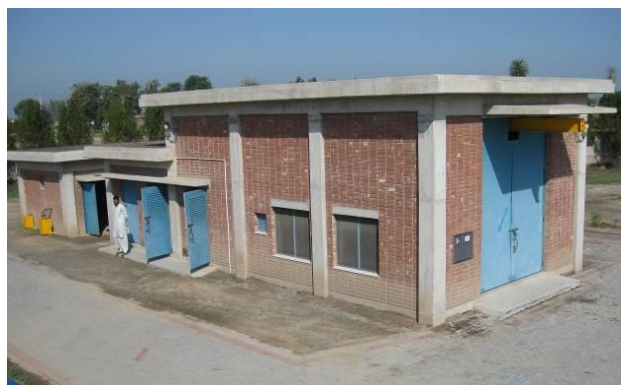
Chlorinator Building at Booster Pumping Station