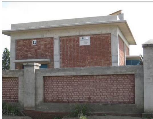
Tubewell Pumping Station (No.11)

Consequently, this project has to some extent achieved its objectives with some issues to be improved. Therefore, the effectiveness and impact of the project are fair.