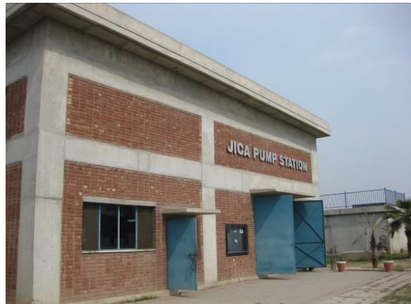
Terminal Reservoir and Pumping Station