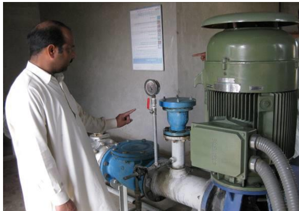
Tubewell Pump Equipment and Operator