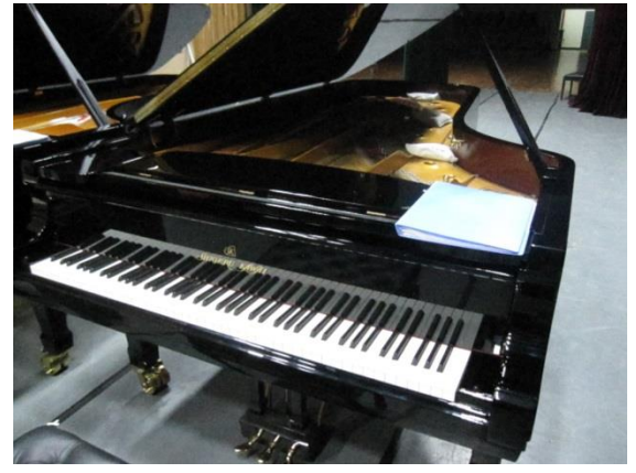
Piano procured under the Project (Gannan Normal University : Jiangxi)