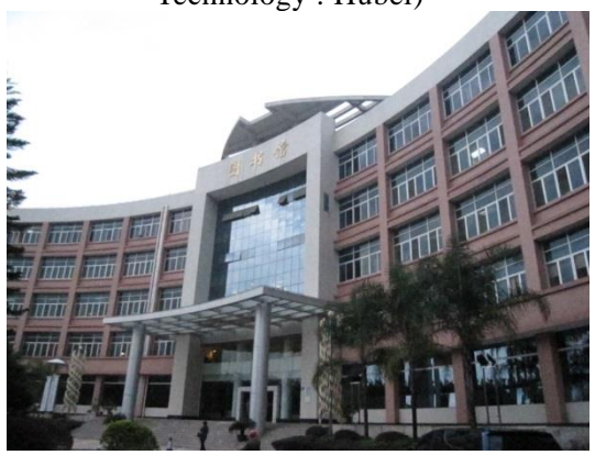
Library building constructed under the Project (Guilin Medical University : Guangxi)

As part of the Project, the training of teachers of the targeted universities in Japan (in principle, individual universities and teachers hoping to undergo such training select the host universities and tutors (professors) and make individual arrangements for their training) was conducted under the soft component. The actual outputs of this training are shown in Table 6.