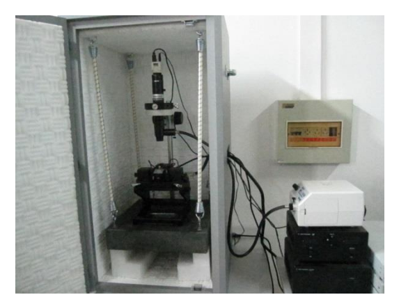
Microscope procured under the Project (Wuhan University of Science and Technology: Hubei)