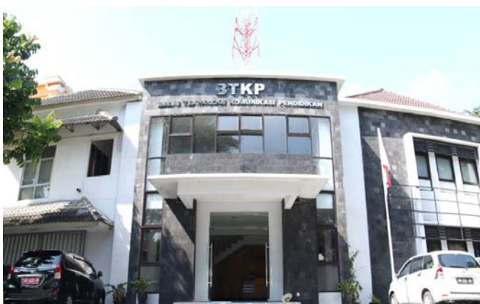
Education Communication Technology Center (BTKP)

The points are summarized as follows. The ICT utilizing education was highly developed in the targeted 500 schools with enhanced educational motivation both in teachers’ and learners’ sides under this project. The project is also contributing to the regional equalization of education. In addition to that, variety of ICT teaching materials and information are being distributed by enhanced BTKP by this project through internet over the boundary of Yogyakarta Special Region. It enables ICT