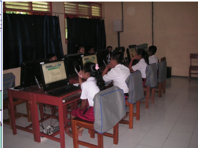
ICT Utilizing Classwork at Primary School PC Lab