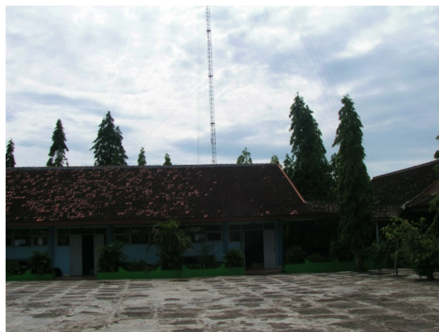
N3 Wonosari Secondary School at Kabupaten Gunung Kidul and Tower Antennae installed under this Project

Yogyakarta Special Region consists of one City (Kota) and 4 Regencies (Kabupaten). The numbers of total and selected schools under this project are indicated as follows (Table 3). The performance of implementation was as planned.