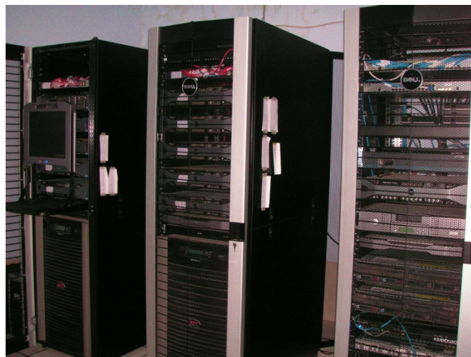
Server and Other Equipment Contained in the Rack Mount in IDC

IDC is a unit mainly functioning for system development relating to establishing educational information database, helpdesk operation, educational contents management and gateway functions 10 , which was set up at BTKP. Main equipment installed under this project consists of various kinds of servers, UPS (Uninterruptible Power Supply), antennae, helpdesk equipment and materials for developing educational contents. The performance of implementation was as planned.