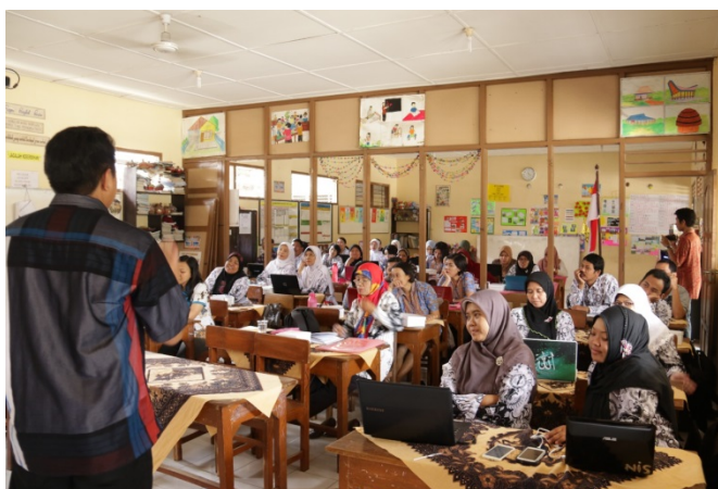
Facilitation at a Primary School

In addition to the intensive capacity development activities (A to C), ad hoc hands on facilitation was widely conducted by the consultants, PF and BTKP staff.