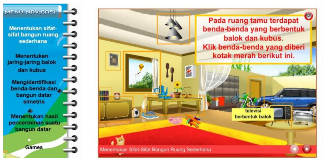
Figure 3: Example of e-Learning Material Developed (Primary School Geometry: “Flat Figure” and “Solid Figure”)

At Muhammadiyah Bodon Primary School, in addition to the production of own ICT teaching materials using LECTORA introduced in the project, one of the teachers has written and published a detailed book manual regarding teaching material development using LECTORA. The book is being commercially sold at bookshops, and it is already the third impression which is published since the first publication in November 2012 contributing to dissemination of method of e-Learning material production to many educators and educational agencies 23 . The performance of the two schools above is prominent from others, which is judged due to individual talent and capability of the teachers in charge who directly dealt with this project implementation and operation.