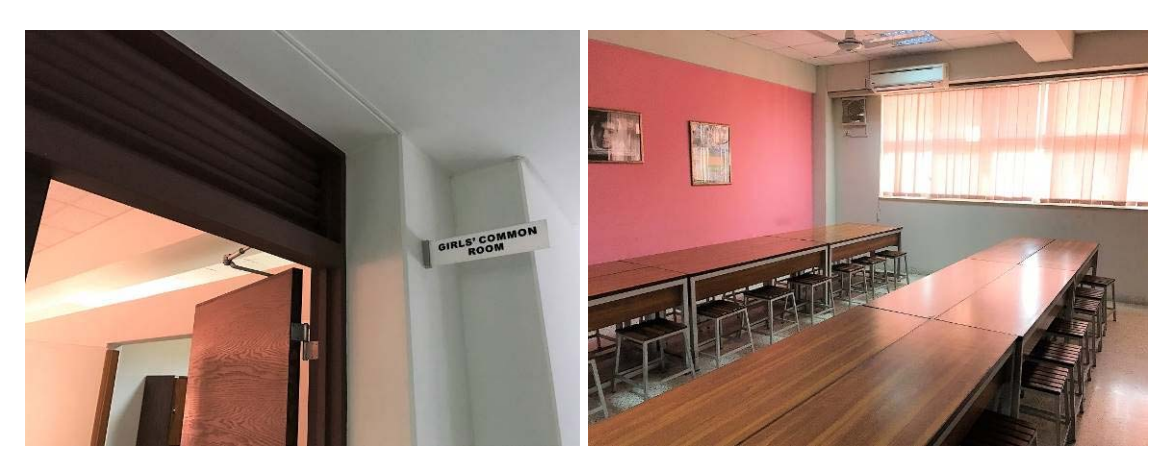
Exclusive lounge for female students of the Architecture Department

According to GCT RR, the planning, design and actual quality of the buildings and equipment are generally excellent. The field survey for this ex-post evaluation did not find any specific problems in regard to the planning, design and actual quality of the facilities and equipment provided under the Project. However, many of the existing workshops in which the newly supplied equipment has been installed are fairly cramped. Some of them appear to suffer from poor ventilation due to the insufficient provision of windows and/or a ventilation system.