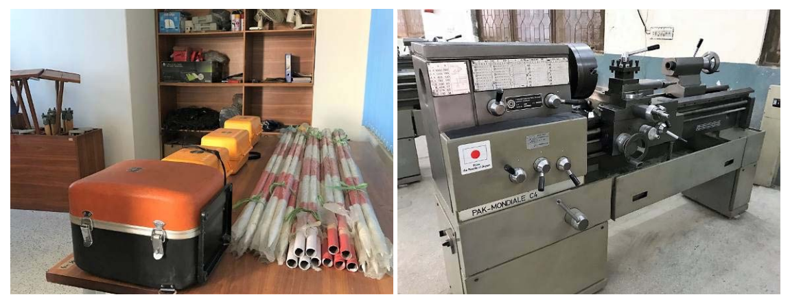
(Left) Survey equipment and tools of the Architecture Department (for practical training), (Right) Lathe machine of the Mechanical Department (for practical training)