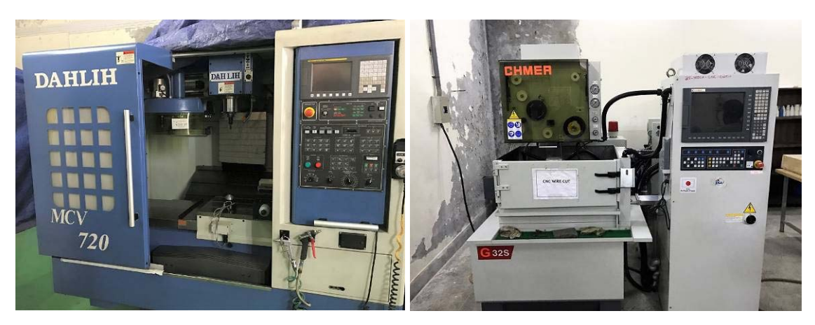
CNC processing machines of the Architecture Department (for practical training)