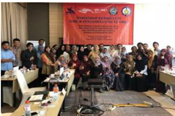
EPI UNET workshop on outcome-based education in Surabaya in February 2018