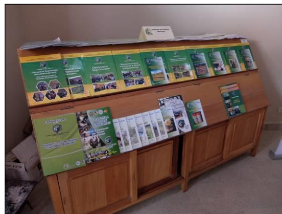
IDRI is actively utilizing the list of techniques and training materials created by the project (IDRI, USFX)