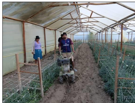
Carnation grower who ships to the market in Sucre (San Jose de Molles, Municipality of Yamparaez)