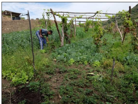
Non-target vegetables farmer supported by the municipality (Cerezal, Municipality of Zudañez)

It is considered that the actual cost was less than the plan by 17% for the reason that there was a period of stagnation of the project activities such as a temporary stop to accept applications for mini-projects, in the process of the Department departing from the project. From 2013 on, the mini-projects were again implemented without contributions from the Department. However, as a whole, there was a possibility that the number of mini-projects was suppressed. In addition, according to the documents provided by JICA, since the application of a mini-project was prepared based on the intention or plan of the community, it was difficult to estimate accurately the number of projects, amount of money, timing of start and so on. As a result, a total of 266 mini-projects in the 36 target communities, meaning seven projects per community on average, were carried out for environmental protection, production improvement and social development. From the above, it is judged that these inputs were commensurate with the outputs and provided flexibly in accordance with the situation. Of the total project cost of the mini-projects, JICA's share of contribution was about 33%.