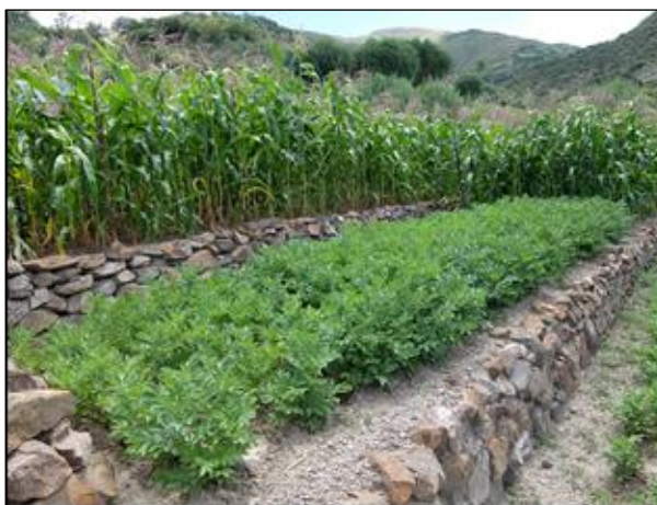
Former demonstration farm where the terrace is maintained (Catana, Municipality of Yamparaez)