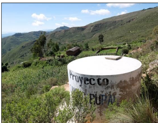
Introduced tank for small-scale irrigation (Misión Pampa, Municipality of Presto)

In view of the above as a whole, the project largely achieved its purpose.