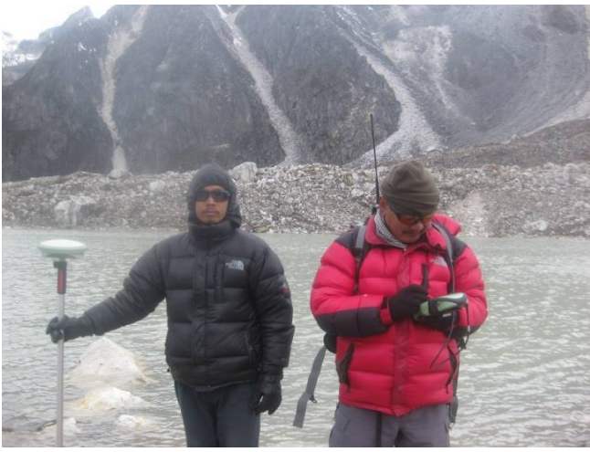
Researchers from NCHM/DGM perform a bathymetric survey at Chamkhar Chhu