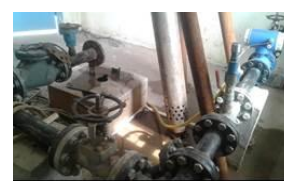
Photo 4. Intake facility of new tube well not used due to breakdown (Dobathar No. 3)

Excessive pumping in existing tube wells was also pointed out during planning of the Project. Therefore, it is necessary that WSSCA acquires technical skills regarding appropriate operation and shares them within the organization for the purpose of avoiding failure in the water pumps. (Refer to recommendations for preventing damage in groundwater supply system).