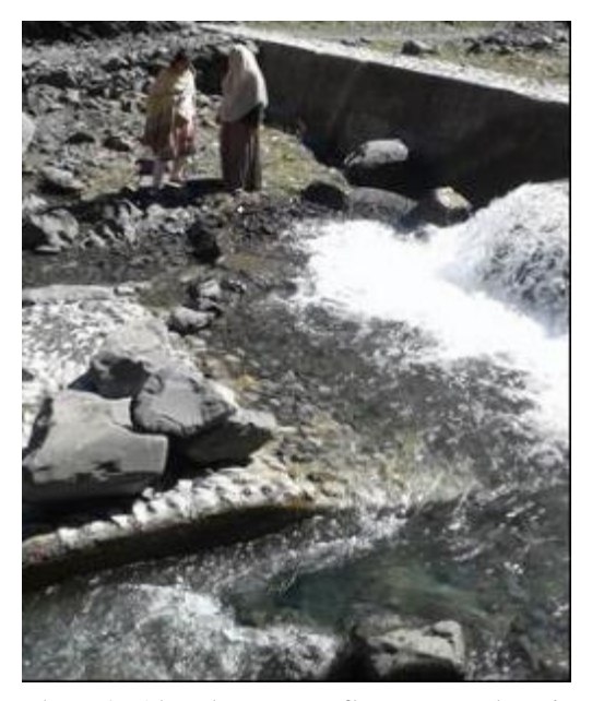
Photo 2. Abundant water flow at Namly Mira water intake facility (taken during interview at site inspection)

The three water intake facilities in operation may also be lower than the design value; however, because the amount of water at Namly Mira is large, the overall surface water supply is complemented to just under 80% (average<sup>14</sup>) of the plan.