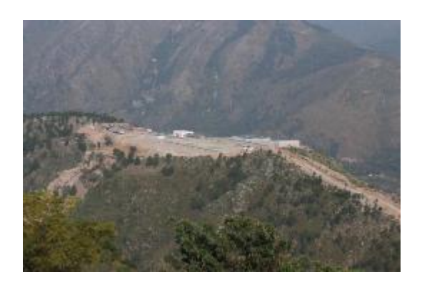
Photo 1. Newly constructed water treatment plant of the surface water supply system (a distant view as of July 2015)