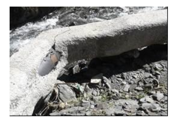
Photo 5. Damage to protective cover of transmission mains at Namly Mira intake facility due to flooding

The protective cover of the transmission mains has been damaged at Namly Mira intake facility due to flooding during the rainy season. JICA has implemented a follow-up study since March 2018, and necessary response measures for emergency construction and repairmen after emergency measures etc. are under consideration. According to the executing agency, it is necessary to re-arrange the route of the transmission mains where the foundation is damaged.