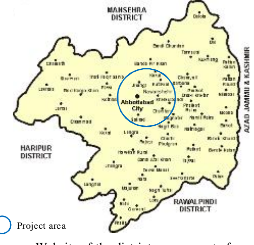
Project Location