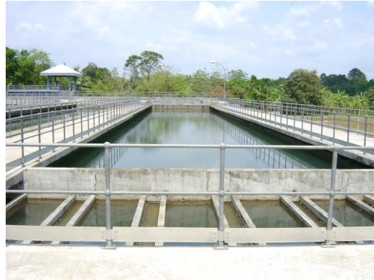
Kadana water treatment plant