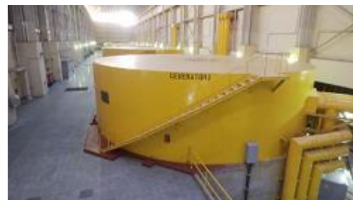
Generator floor of the Jebba Hydro Power Station No. 1 Generator (front) – No. 6 Generator (back)