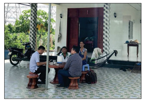
Photo 5: Interview to Resettled Resident by 500kV My Tho Substation

This project has achieved its objectives to some extent. Therefore, effectiveness and impacts of the project are fair.