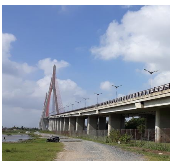
Can Tho Bridge