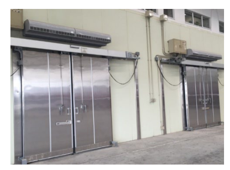
Cold Storage Facilities

The international cargo terminal at DIA has been receiving vaccines and medical supplies sent from foreign countries as emergency assistance. The lack of cold storage at the old terminal limited the handling of medical supplies to tablets and other items that can be managed at room temperature, but the cold storage facilities installed in the Project have enabled vaccines and medicines transported by air to be managed at the appropriate temperature. Due to the limited capacity of the refrigeration facilities of the Ministry of Health in Tajikistan, the DIA accepted approximately 50 tonnes of vaccines and medicines transported as emergency relief supplies, and most of the vaccines were transported directly from the airport's cold storage facilities to medical facilities around the country. According to the Ministry of Health, it would have been difficult to accept the same amount of vaccine without the cold storage facilities at DIA, and the facilities established at the airport have contributed to the country's fight against Covid-19.