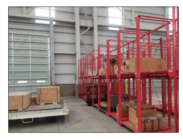
Inside of the Cargo Terminal

Transportation companies using the cargo terminal at DIA also reported effects such as an improvement in cargo quality control and enhanced operational efficiency by mechanized cargo handling works with the installation of new equipment. Furthermore, before the cold storage facilities were set up, it was difficult to store goods that require temperature control, such as fruit, Tajikistan's main export cargo, for more than four hours. At the time of the ex-post evaluation, however, it is possible to handle these goods under appropriate temperature control, contributing to maintaining the quality of the goods.