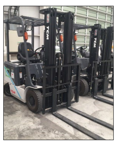
Equipment for Cargo Handling