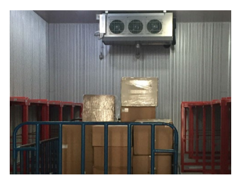
Inside of the Cold Storage

After the implementation of the Project, the airport has been able to use high-accuracy ILS for all departures and landings, which has improved the safety and reliability of aircraft operations. Although the opening of the border gate to Uzbekistan, Covid-19 and the Ukraine situation have restricted a number of air services, and the actual cargo handling volume has been below the baseline value, the cargo terminal has streamlined cargo handling operations and helped maintain the quality of cargo, including perishable goods. Furthermore, the impact of the use of cargo terminal facilities to transport emergency assistance (medical supplies) and to handle medical