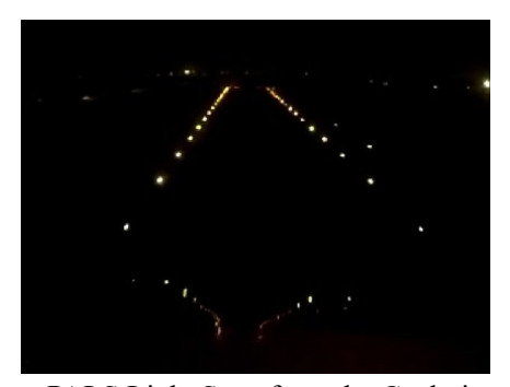
PALS Light Seen from the Cockpit