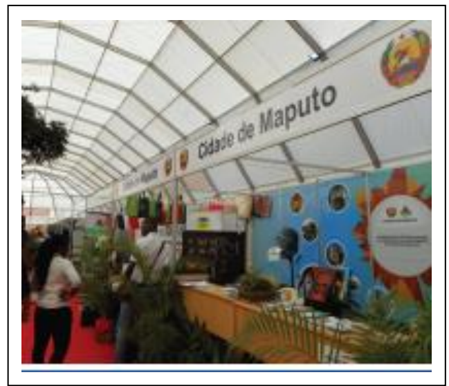
FACIM, the largest exhibition in Mozambique where APIEX is one of host agencies.