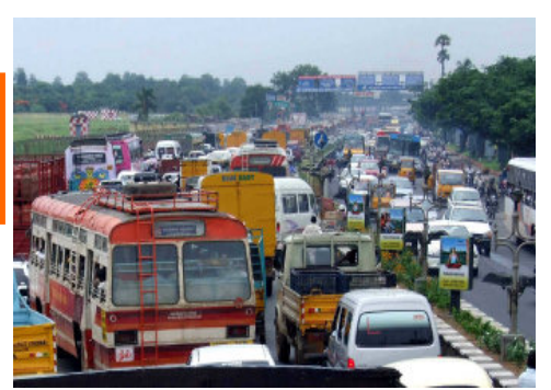
Traffic Jam near Project Site

(State of Haryana, Gujarat, and Rajasthan)