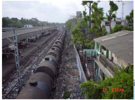
Current Freight Railway

Dedicated Freight Corridor Project (Phase-1) (II)