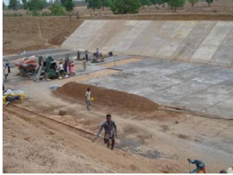
Construction of Main Canal