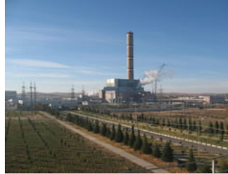
Talimarjan Thermal Power Station

5. The nation has modernized existing power plants to use energy more efficiently and provide a stable power supply. It has also prioritized the development of new power plants utilizing the deposits of natural gas. In a presidential resolution in March 2009, this project was also given a priority among national projects in the power sector for implementation between 2010 and 2014. JICA's policy is to support the energy sector through technical cooperation and other measures.