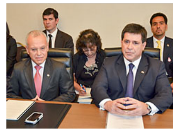
Horacio Manuel Cartes(right), president of Paraguay, and Germán Hugo Rojas, minister of

In Paraguay, a landlocked country, trade takes place using river transportation on the Paraná and Paraguay Rivers (69 percent), and road (22 percent) and air (9 percent) transportation to neighboring countries, making trade reliant primarily on rivers and roads as transportation means. Of the some 62,000 kilometers of roads in the country, however, only about 8 percent (5,000 kilometers) which is mainly trunk roads has been paved, a number that rises to only 14 percent (9,000 kilometers) when gravel improvements are included. In addition to unimproved sections of road being impassable by automobiles during rainy weather, they are damaged on the surface by trucks and the lack of improvements has other adverse effects such as lowering the travel speed of traffic, and damaging vehicles and cargo.