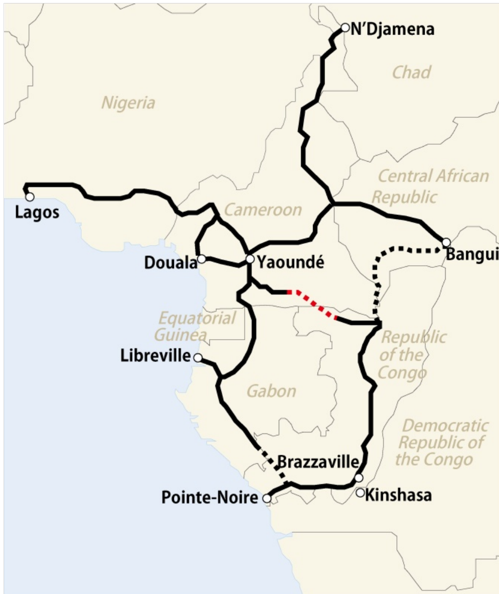
Map of the target region and surroundings. Dotted lines represent unpaved roads. The target section is located on the dotted line in red.