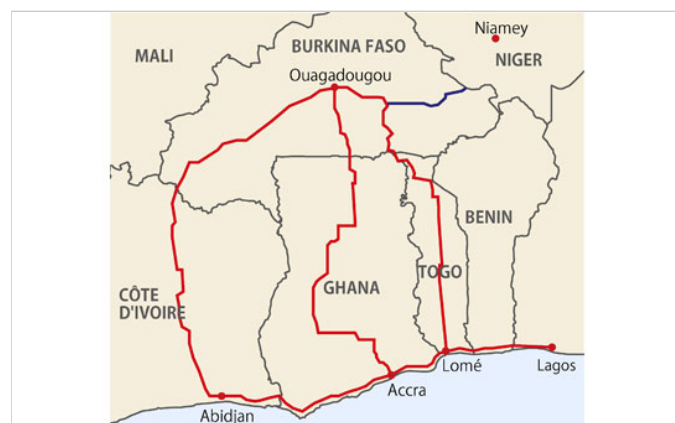
Map of the target region and surroundings. Red lines represent the international corridors of the West Africa Growth Ring. The target section is along the blue line.