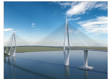
The composite image of the Mombasa Gate Bridge